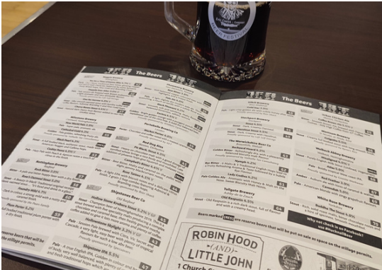
Some of the 80 odd beers available