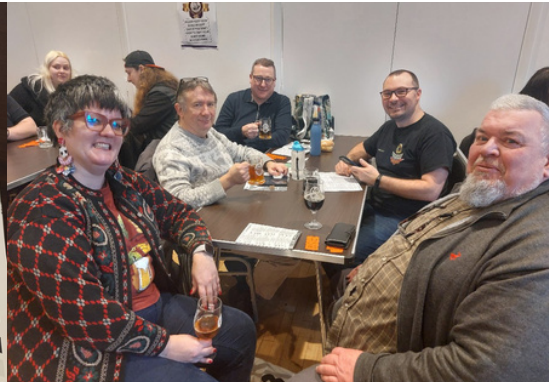
Committee members, old and new