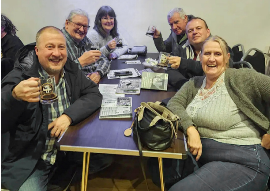
Branch members enjoying the beer