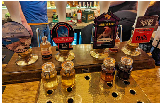
Ales at the Dandy Cock

The last Friday of January saw the introduction of our regular social - Final Friday @ 5. Sutton was chosen for the first outing where the Picture House and FireRock were visited. We chose Kirkby for February, starting at the Dandy Cock, then moving on to the Dog House and finally The Regent. Both evenings saw a good attendance and great beer was enjoyed along the way. March takes us to South Normanton where we plan to visit four pubs - starting at The Villager before moving on to The School House, The Clock and The Market Tavern.