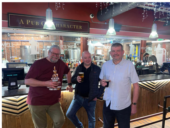
Chairs of M&A, North Notts and Erewash Branches

Saturday 30th December saw the branch Christmas social in Mansfield and the first since it was reformed. Four pubs in and around the town centre were chosen, starting at the Railway Inn on Station Street. Not only is the pub near to the railway station (as you would imagine from the name) but the pub is also close to the bus station, making an ideal first stop however you arrive in town. The ex-Bateman's hostelry features a cosy, central bar with two smaller rooms if you fancy a quieter pint. Well-priced, home-cooked food is available. The pub has LocAle status, and on the bar during our visit were Welbeck White Stag, Woodforde's Albion, Dancing Duck Abduction and Full Mash Apparition; three of which are within the distance to qualify for the award.