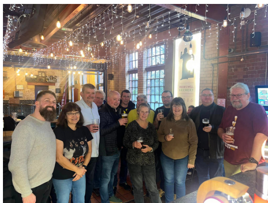
Some of the group at Prior's Well

Our next stop, at the other end of Great Central Road, was the Brown Cow. The once Raw Brewery pub is now co-owned with Everards under their 'Project William' scheme. The large interior comprises two areas served from a central bar with another large room on a lower level to the left of the building. There is also a beer garden to the rear. Like Priors Well, it features a modern décor with plenty of exposed ironwork in the bar. The Brown Cow took 1st place in last years multi-branch Winter Ale Trail and the certificate is proudly displayed behind the bar. The line-up on the day was Neptune Brewery Galene, North Riding Riwaka, Welbeck Abbey Cocoa Noel, Anarchy Brew Co. Citra Star, Woodforde's Winter Reserve, Small World Long Moor Pale, Ashover Galaxy, Brunswick Last Orders and Everard's Tiger and Mirage.